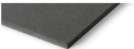
Cembrit Patina Original