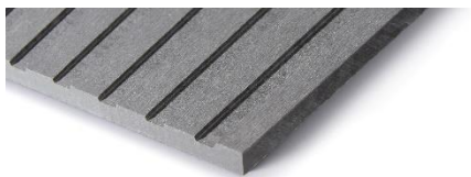
Cembrit Patina Inline